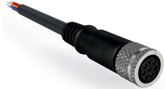
type of connection GE

Voltage drop should be envisaged with increasing cable length. This should be taken into account for the electrical design.